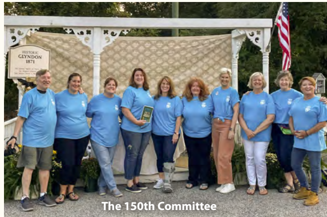
The 150th Committee

our celebration. A big THANKS is extended to Northwest Chamber of Commerce for collaborating with us on communications, and Baltimore Style magazine for featuring a wonderful article on Glyndon and the 150th!